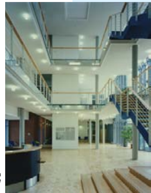
The foyer of the institute is a bright, friendly place