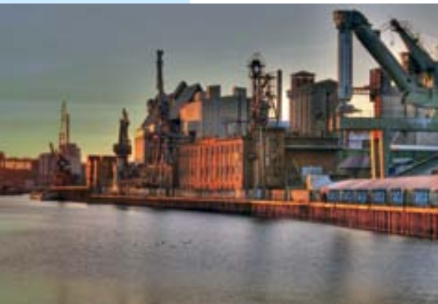
Harbour scene at sunset

Hegarty's Ostertorsteinweg 80 www.hegartys.de Irish Pub with a quiz night every Monday. Shows live football matches. Viertel.