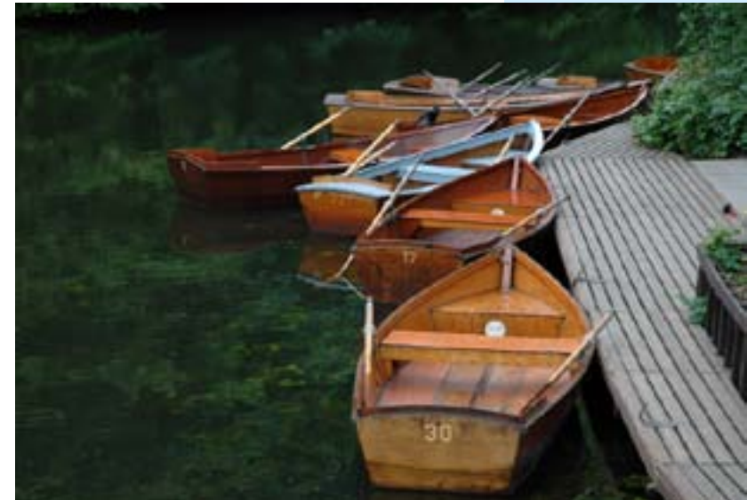
Rowing boats in the Bürgerpark, the park in the heart of Bremen

Bremer www.bremer.de Available at newspaper kiosks.