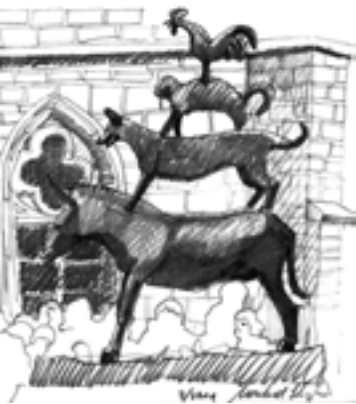
The Town Musicians of Bremen

2004, the 600-year-old Statue of Roland and the Town Hall were honoured with a place on UNESCO's World Heritage List. Opposite the Town Hall the Schütting, the prestigious home of the Chamber of Commerce and Industry is located. Bremen's overseas trade in cotton, tea and rice is traditionally represented by the Cotton Exchange, or "Baumwollbörse", at the south-east edge of the market square. A must see is the Schnoor Quarter in the southeastern city center with its narrow lanes and houses that partly date back to the fifteenth century. The quarter was originally inhabited by fishermen and shipbuilding traders and nowadays hosts