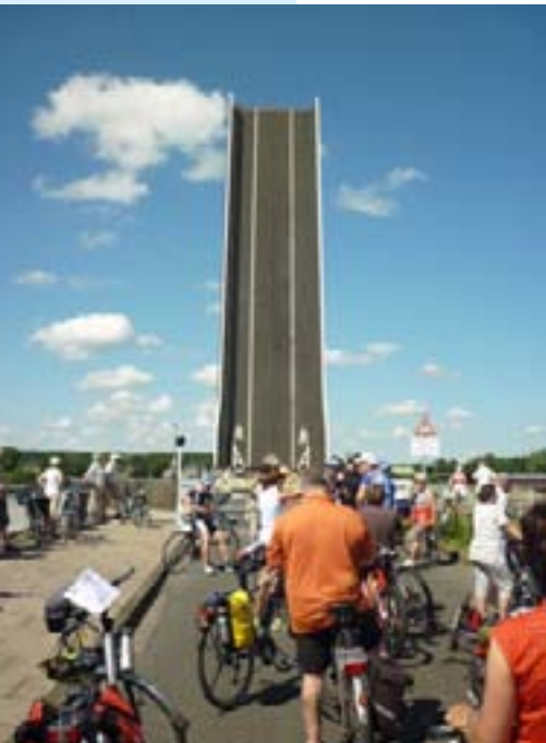
Cyclists waiting to pass a lift bridge on a sunny weekend

The institute is closed between Christmas Eve and New Year.