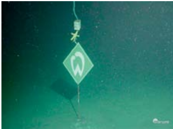
The flag of Werder Bremen - the soccer team of Bremen. Here, at 2000 m depth in the Black Sea.