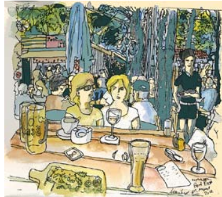
Not only good for a break after a canoe trip: Port Piet on a sunny day

Bremer Ratskeller Am Markt www.ratskeller-bremen.de Restaurant with a 600 year old tradition at the market place. Wine tasting and guided tours through the expansive wine cellars. City center.