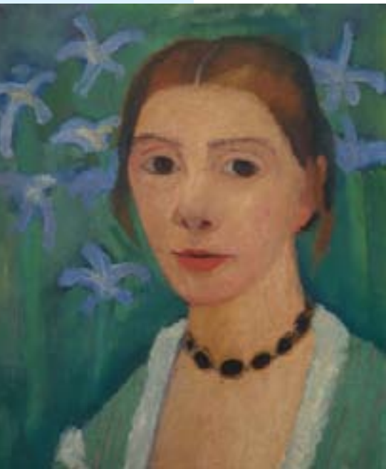
Kunsthalle Bremen - Der Kunstverein in Bremen

Self portrait of Paula Modersohn-Becker, a painter from Worpswede near Bremen