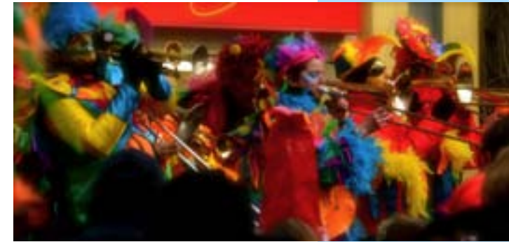
Carnival in Bremen attracts Samba bands from all over Europe

Christmas markets in the Bremer city centre.